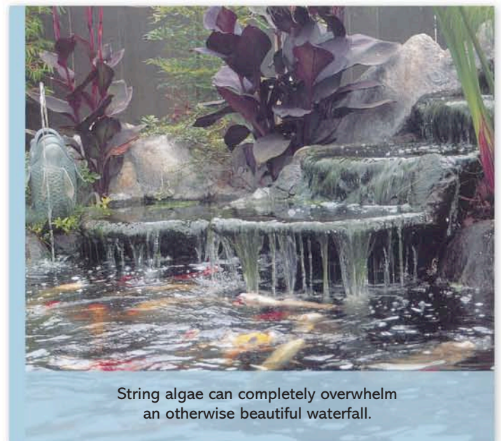
String algae can completely overwhelm an otherwise beautiful waterfall.

Waterfalls and streams are home to many size rocks. These rocks create crevices that will often trap wind blown leaves. If you notice a few leaves here and there you can probably pick them out by hand. If you find a lot of leaves in your waterfall or stream it is important to remove them as they will decay and affect the quality of your water if you do not. The very best way to remove an abundance of leaves is to turn off the waterfall and allow the rocks and leaves to dry out. Once dry, a regular leaf blower is perfect to dislodge most trapped leaf